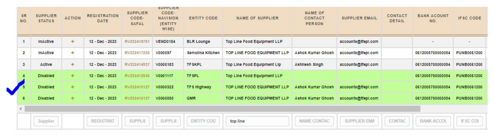
Showing 1 to 6 of 6 entries

Supplier contact person name: Akhilesh Supplier contact number: 9873239871 Supplier email: accounts@tfepl.com