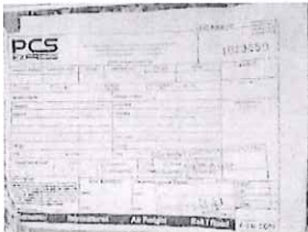
1023950 POD.jpeg 270K