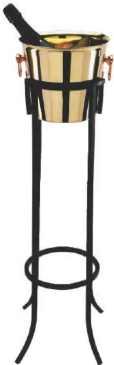
WBS 840 PLG