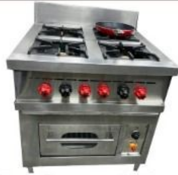
Four Burner with Oven