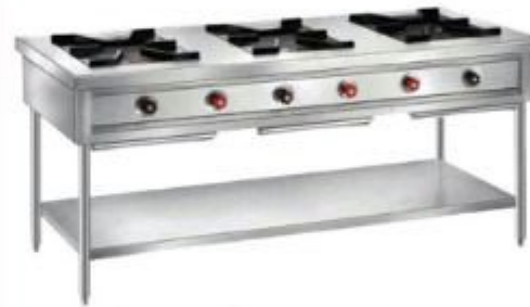
Three Burner Range