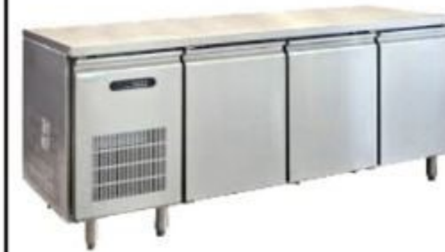
Three Door Under Counter