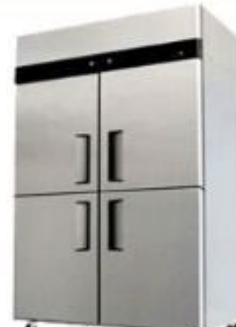
Four Door Refrigerator