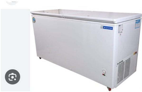
Blue Star CF3-500MEW Deep

2. 6 DOOR REFRIDGERATOR VERTICAL On behalf of this we have finalise below model