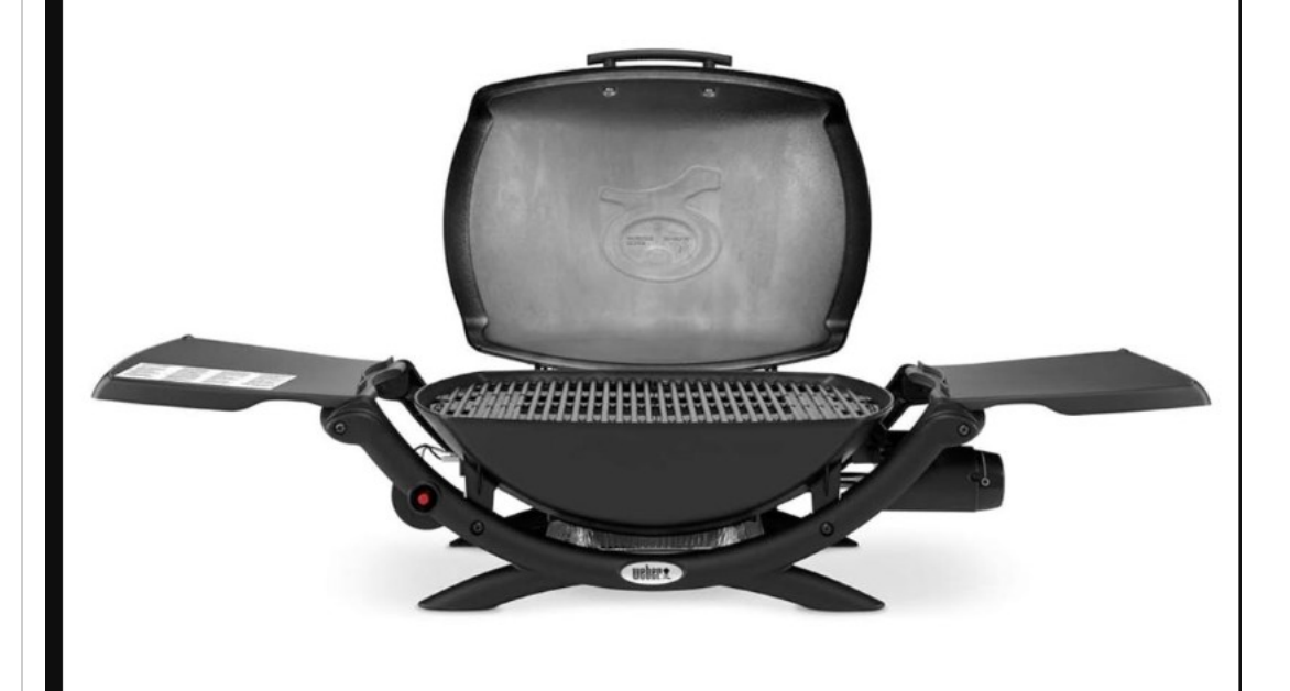
Thanks & Regards,

Weber Q2000 Gas Grill Barbeque | Table Top BBQ Grill & Char Griller with Foldable Side Tables | Cast Aluminium Lid Cover & Body | Portable Premium Mini Gas BBQ | Home or Travel - Black (53010074)