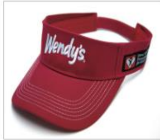
Visor WN715 - USA WN717 - CA 100% Cotton Twill One Size $2.57