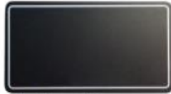
Chalkboard Crew Name Badge WN911 Plastic 3" x 1.5" $0.58