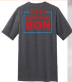
We Don't Cut Corners WN345/WN345X 50% Cotton / 50% Polyester XS - 5XL