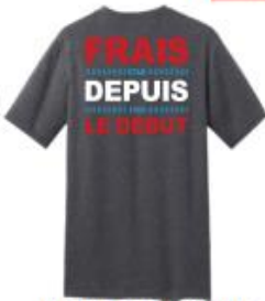
Fresh Since Day One WN343/WN343X 50% Cotton / 50% Polyester XS - 5XL