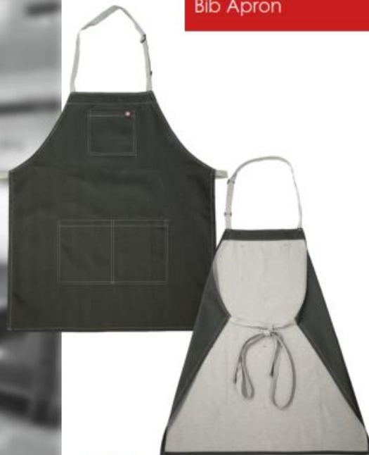
Black Denim Bib Apron WN802 50% Cotton / 50% Polyester One Size $4.80