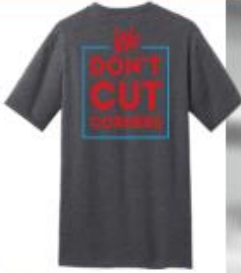
We Don't Cut Corners WN336/WN336X 50% Cotton / 50% Polyester XS - 5XL