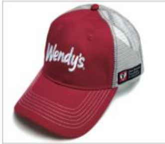
Trucker Hat WN714 - USA WN716 - CA 100% Cotton Twill with 100% Polyester Soft Mesh One Size $2.57