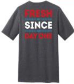
Fresh Since Day One WN334/WN334X 50% Cotton / 50% Polyester XS - 5XL