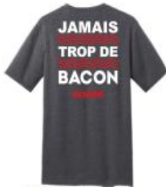
Baconator® WN344/WN344X 50% Cotton / 50% Polyester XS - 5XL