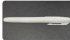
Pen WN601 Plastic $0.92