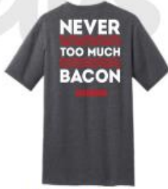
Baconator® WN335/WN335X 50% Cotton / 50% Polyester XS - 5XL