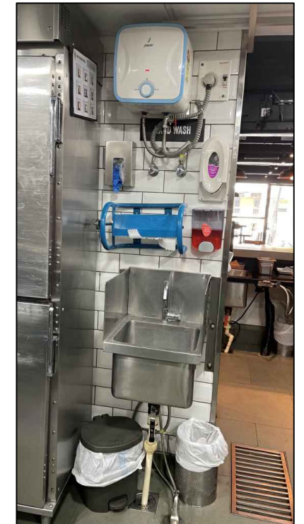
HAND WASH WITH GEYSER