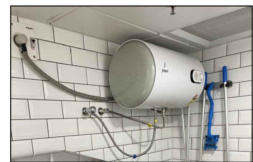
GEYSER OF DISH WASHING AREA