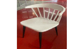
REFERENCE IMAGE FOR GREY & WHITE RIB CHAIR