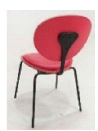
REFERENCE IMAGE FOR PYW CHAIR

HEAD OFFICE:- Anchorage, off Govandi Station Rd Near Amarnath Patil Ground, Govandi-(E) Mumbai 400 088 TEL: +91 22 6740 7640. Email: studio@whitewaterdesign.in