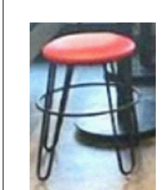
REFERENCE IMAGE FOR POUFFE