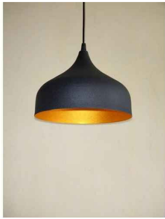
REFERENCE IMAGE FOR DOME SHAPED HANGING LIGHT