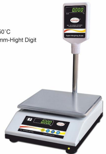
Optional Pole Display (instead of in-built dual display)