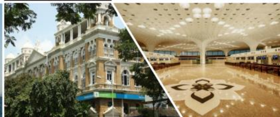
Mumbai International Airport