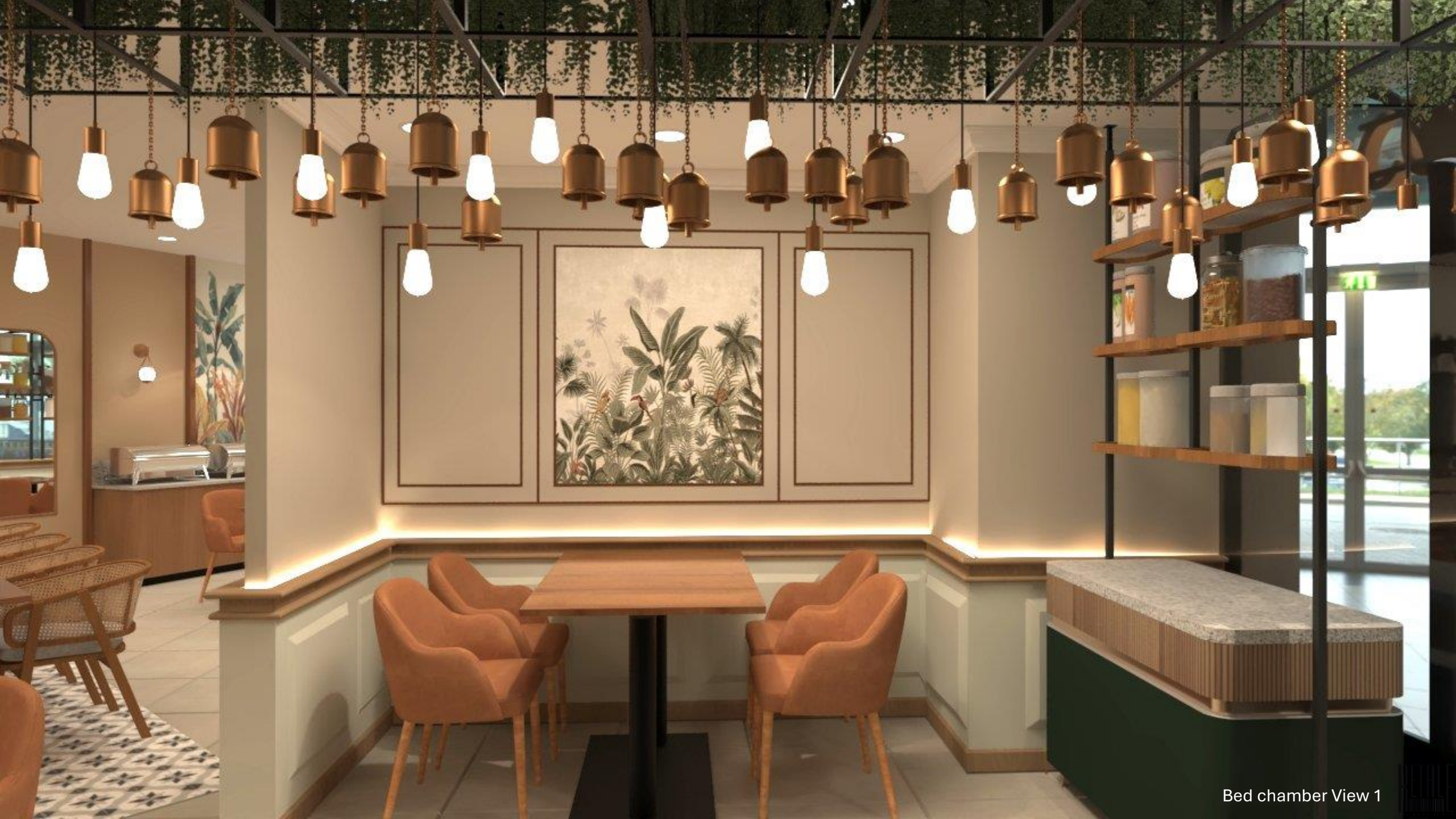
Bed chamber View 1