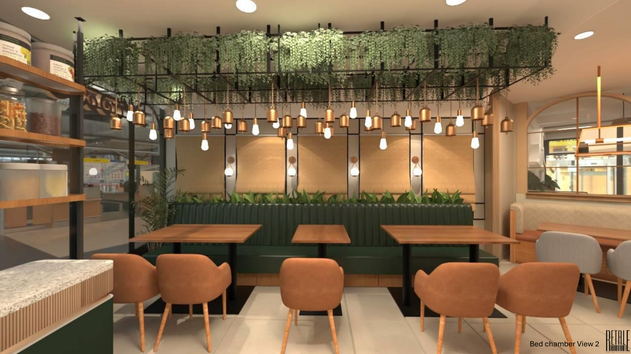
Bed chamber View 2