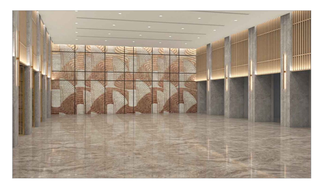
REFERENCE VIEW 02