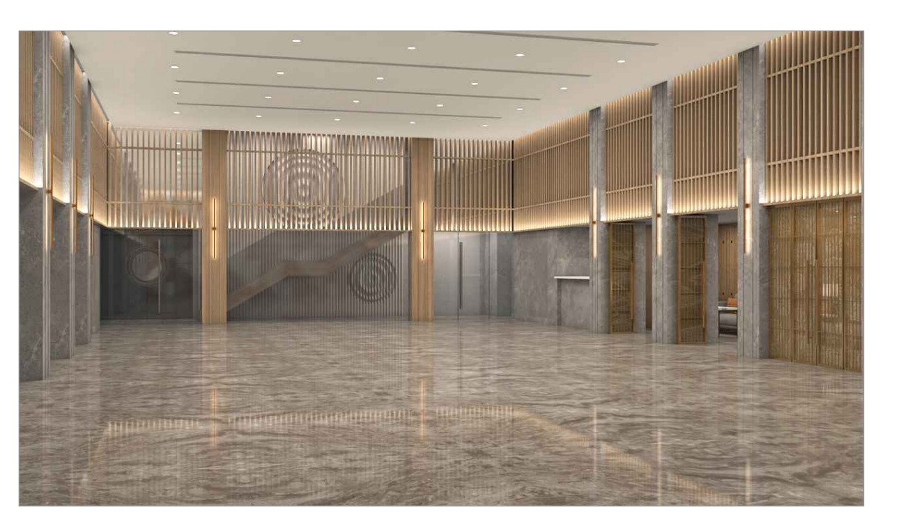
REFERENCE VIEW 01