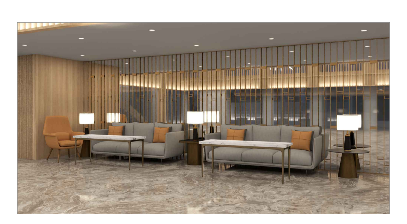
REFERENCE VIEW 03