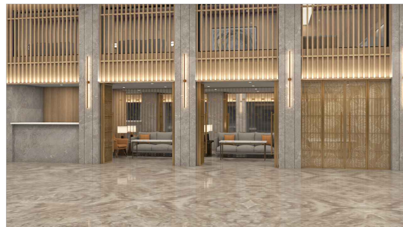
REFERENCE VIEW 01