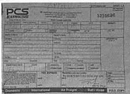
1010696 pod.jpg 136K