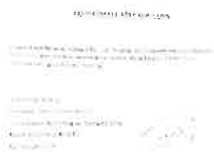
1020003-INV (2).jpeg 102K