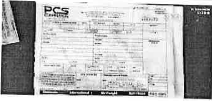
1018870 POD.jpeg 120K