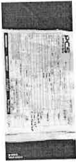
1013151 POD.jpeg 102K