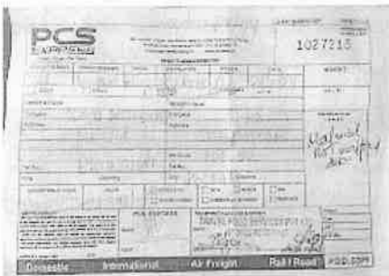
1027215 POD.jpg 266K

Email : pcs.courier@gmail.com | +91 8976076545 | +91 22 6236 0112