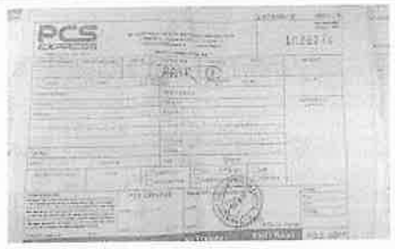
1025922 -POD.jpeg 127K

Email : pcs.courier@gmail.com | +91 8976076545 | +91 22 6236 0112