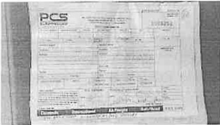
1026253 POD.jpeg 132K