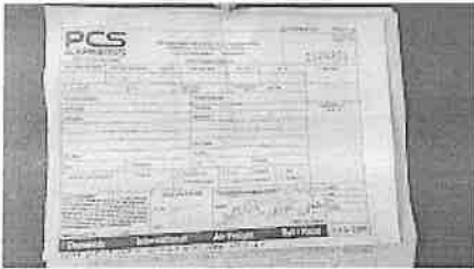
1026251 POD.jpeg 130K