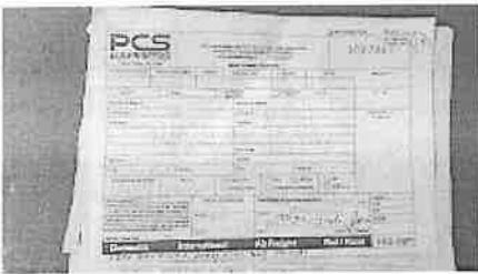
1027349 POD.jpeg 131K