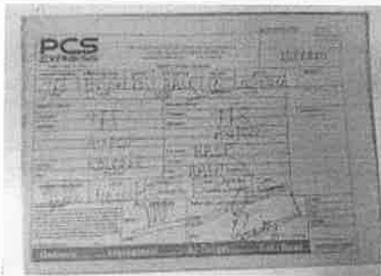
1022840 POD.jpg 174K

Email: pcs.courier@gmail.com | +91 8976076545 | +91 22 6236 0112