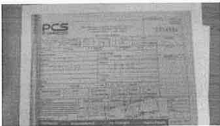
1024534 POD.jpeg 110K

Email : pcs.courier@gmail.com | +91 8976076545 | +91 22 6236 0112