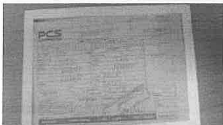
1022820 POD.jpeg 92K

Email: pcs.courier@gmail.com | +91 8976076545 | +91 22 6236 0112