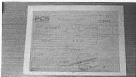
1024439 POD.jpeg 106K

Email : pcs.courier@gmail.com | +91 8976076545 | +91 22 6236 0112