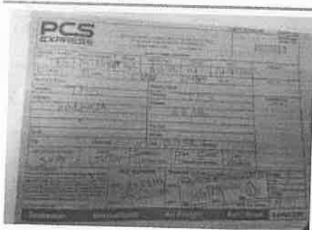
1022313 POD.jpg 109K

Email : pcs.courier@gmail.com | +91 8976076545 | +91 22 6236 0112