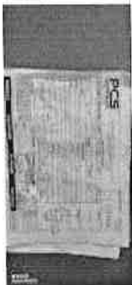
1024666 POD.jpg 103K

Email: pcs.courier@gmail.com | +91 8976076545 | +91 22 6236 0112