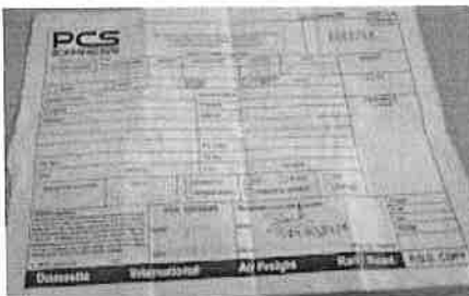
1021744 POD.jpeg 81K

Email : pcs.courier@gmail.com | +91 8976076545 | +91 22 6236 0112