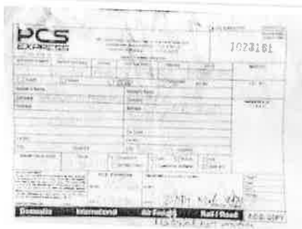
1023161 POD.jpg 142K