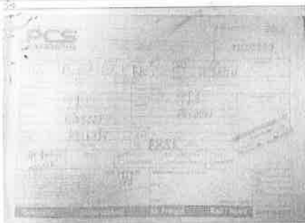
1020993 POD.jpg 92K

Email : pcs.courier@gmail.com | +91 8976076545 | +91 22 6236 0112