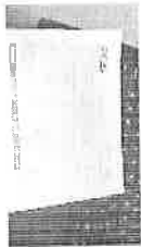
1919826 POD.jfif 93K