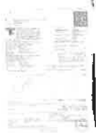
1020856 Invoice.jpeg 183K