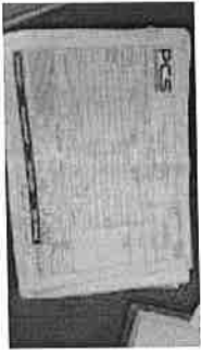
1021680 POD.jpeg 117K