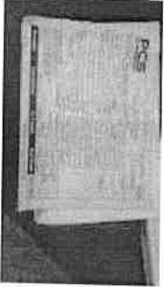
1021679 POD.jpeg 93K

Email : pcs.courier@gmail.com | +91 8976076545 | +91 22 6236 0112