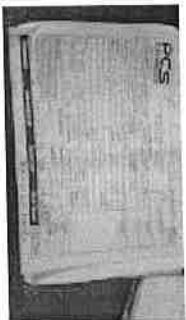
1021677 POD (2).jpeg