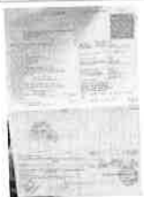
1021108 Delivery Invoice.jfff 82K