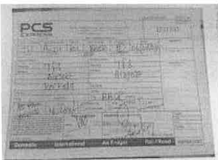
1021592 POD.jff 90K

Email : pcs.courier@gmail.com | +91 8976076545 | +91 22 6236 0112