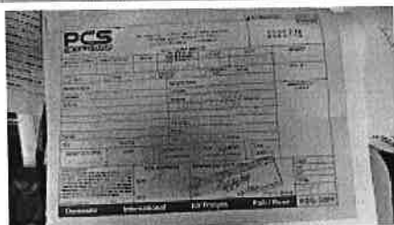
1021771 POD.jpeg 119K

Email : pcs.courier@gmail.com | +91 8976076545 | +91 22 6236 0112