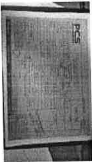
1022369 POD.jfif 99K

Email : pcs.courier@gmail.com | +91 8976076545 | +91 22 6236 0112