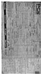
1021803 POD.jpeg 115K