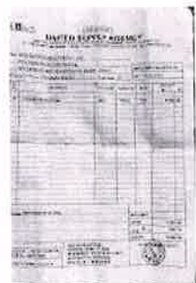
1018302 Invoice.jpeg 136K