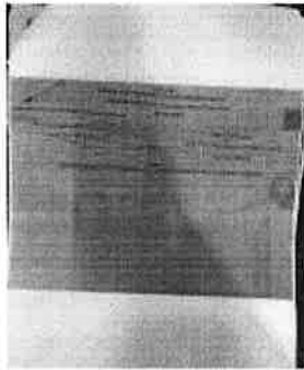
1017733-INV 2.jpeg 139K