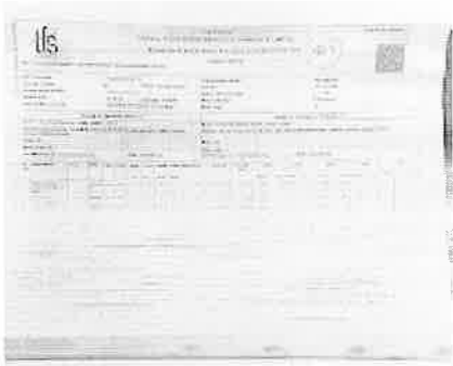
1017644-INV (4).jpeg 73K