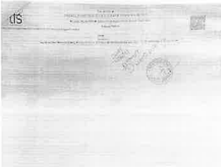
1017644-INV (5).jpeg 49K