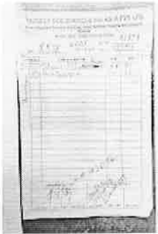
1017644-INV (3).jpeg 100K