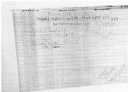
1017644-INV (2).jpeg 83K