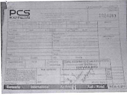
1024363 POD.jpeg 343K