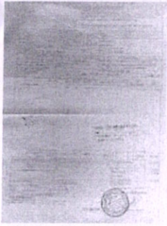
1021507 Delivery Invoice.jfif 176K