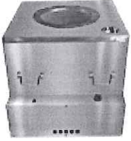
Gas Tandoor With Flame Failure Safety Control