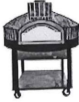
Mosaic Pizza Oven