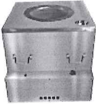
Gas Tandoor With Flame Failure Safety Control