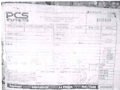
1000617 POD.jpeg 168K